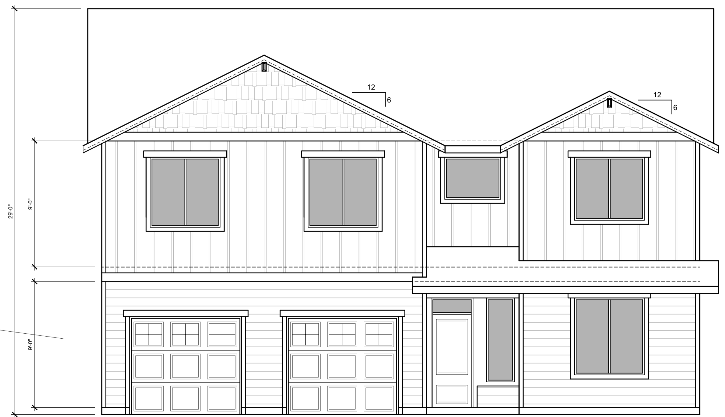
FRONT ELEVATIONS 1/4" = 1'-0"

IN THE EVENT A SITUATION ARISES WHERE AN ITEM WAS NOT SPECIFICALLY DISCUSSED AND NOTED ON THE PLANS OR ADDENDUMS, THE BUILDER MAY AT THEIR DISCRETION MAKE THE CALL IN SUCH A MANNER THAT MEETS INDUSTRY STANDARDS. BUILDER RESERVES THE RIGHT TO SUBSTITUTE PRODUCT, SIZE AND MANUFACTURE AS NEEDED SHOULD ITEMS BECOME UNAVAILABLE, CHANGE IN COST, OR IMPACT THE DESIGN, TIMEFRAME AND QUALITY OF THE HOME.